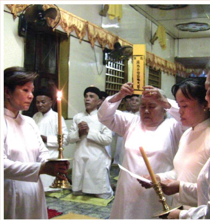
Vietnamese Cao Daiists during a religious ceremony at Thanh Thanh Kim Bien in Phnom Penh, Cambodia