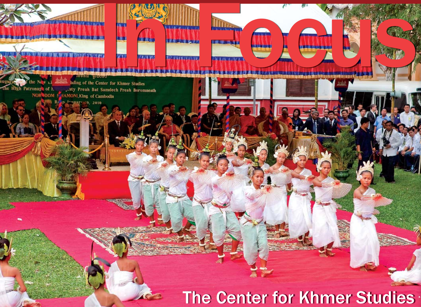
The Center for Khmer Studies