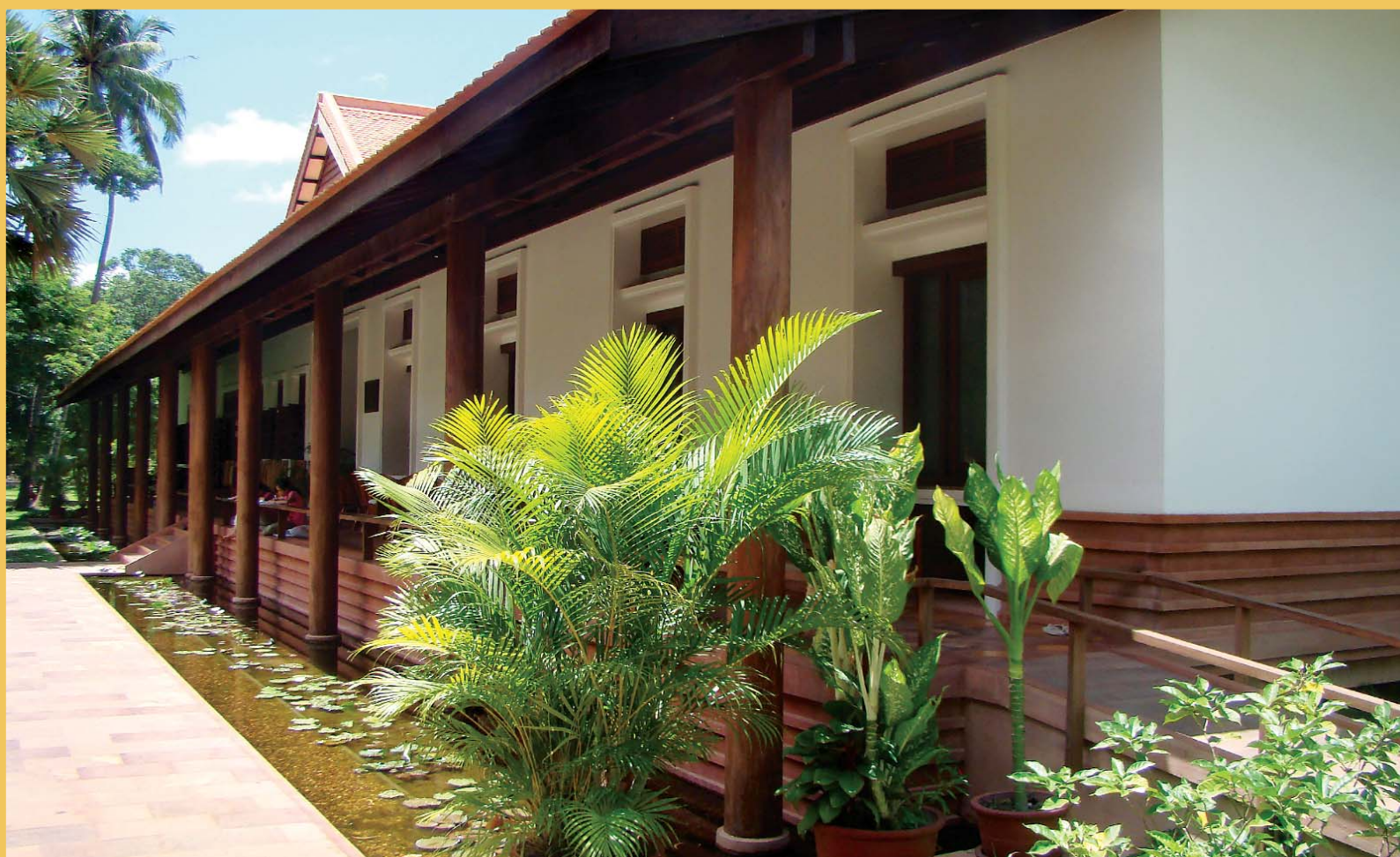
A sweeping view of the terrace and goldfish pond of the new building

T riumphant brasses, the clash of cymbals, the melodious percussive winding of wooden xylophones, banners waving, streets thronged with jubilant Cambodians. The King has arrived at Wat Damnak! January 10th, 2010—a Big Day for CKS and for the people of Siem Reap. His Majesty King Norodom Sihamoni makes his first official visit to Siem Reap on the occasion of the inauguration of CKS's new Research Center and expanded library, of which His Majesty is the royal patron. An honor beyond measure, in recognition of 10 years of CKS's presence in Cambodia and its important contributions to Cambodian education. CKS now has a home, a brilliant new building within the Buddhist pagoda of Wat Damnak.