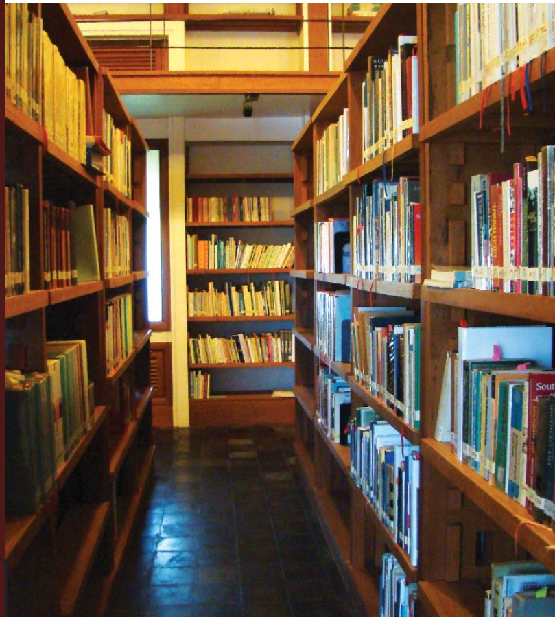
Inside the new library stacks