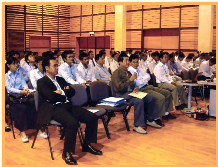
Cambodian universities needs assessment workshop

Both networks were particularly interested in the ways in which CKS helps support Cambodia's higher education