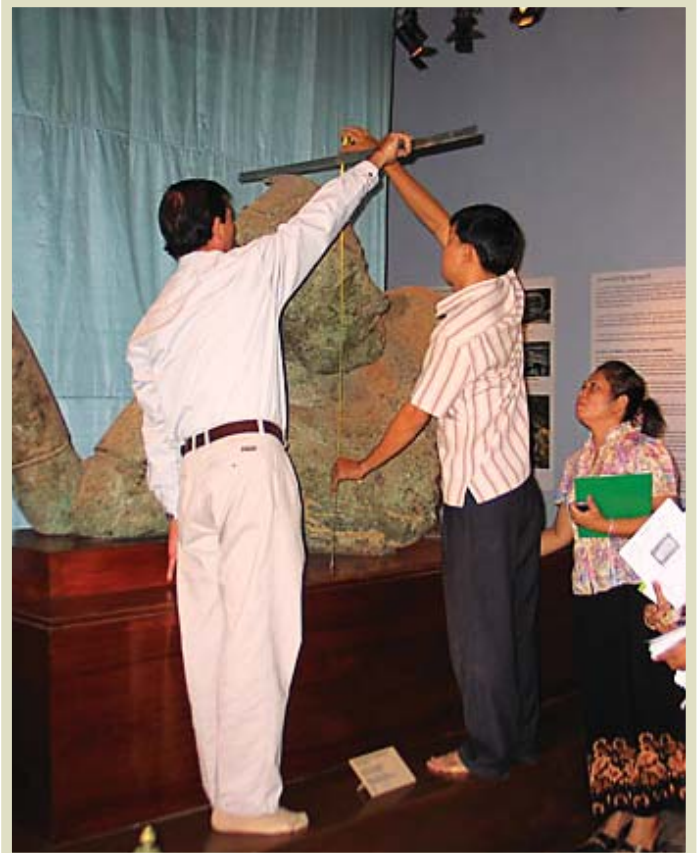
CIP team measuring the Reclining Vishnu on display in a museum gallery in 2010

"When the Museum officially opened on 13 April 1920, there were over 1,000 objects on display. Today the museum has approximately 14,000 objects and the collection is growing at a rate of over 300 objects per year. The majority of the collection is stored in a basement storage area. The project will bring together, and draw on, all existing registration methods used by the Museum at different times in the past, including several French card catalogue systems, Khmer handwritten inventory lists and a pre-existing-database. As part of the inventory and cataloguing project,