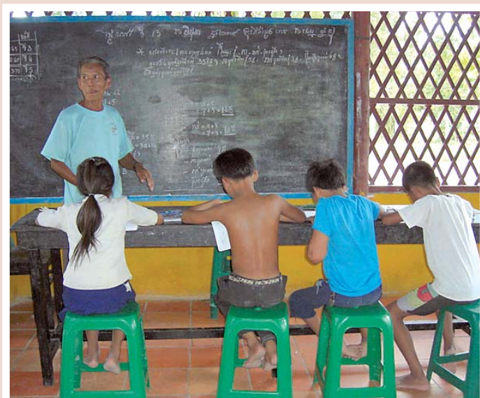
Class at orphanage

tribute to a greater understanding of not just the lives of Cambodian children, but the lives of the millions of chil-