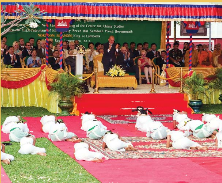
H.M. King Sihamoni rises to greet the young dancers from the Conservatoire Preah Ream Bopha Devi, who have just performed the dance of welcome in His honor