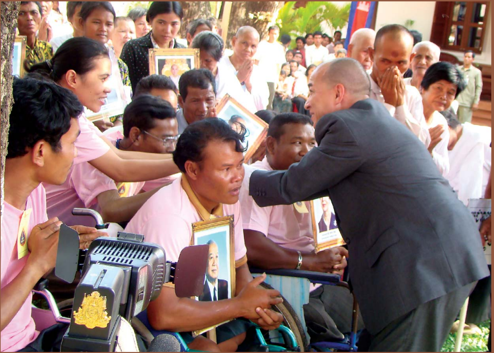
His Majesty Sihamoni greets Cambodians gathered in front of CKS's new building